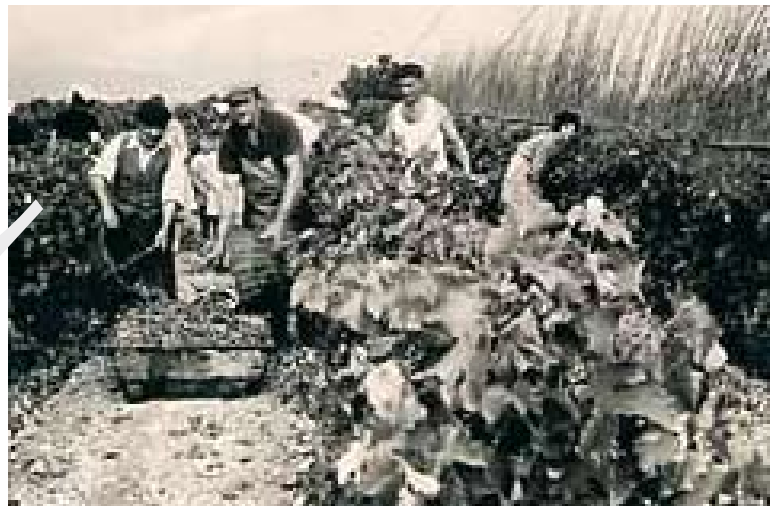
Scène de vendange dans les années 60

Therefore, whether the grapes come from our vineyards or from a scrupulous selection of bought-in grapes, all of our blends come from low yield, meticulously selected and harvested fruit.