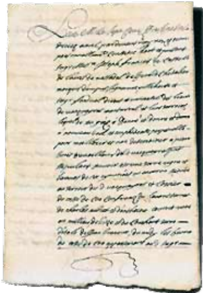
Testament de donation des terres (1717)